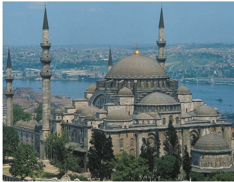
▲ Sinan's Mosque of Suleyman in Istanbul is the largest mosque in the Ottoman Empire.

Cultural Flowering Suleyman had broad interests, which contributed to the cultural achievements of the empire. He found time to study poetry, history, geography, astronomy, mathematics, and architecture. He employed one of the world's finest architects, Sinan, who was probably from Albania. Sinan's masterpiece, the Mosque of Suleyman, is an immense complex topped with domes and half domes. It includes four schools, a library, a bath, and a hospital.